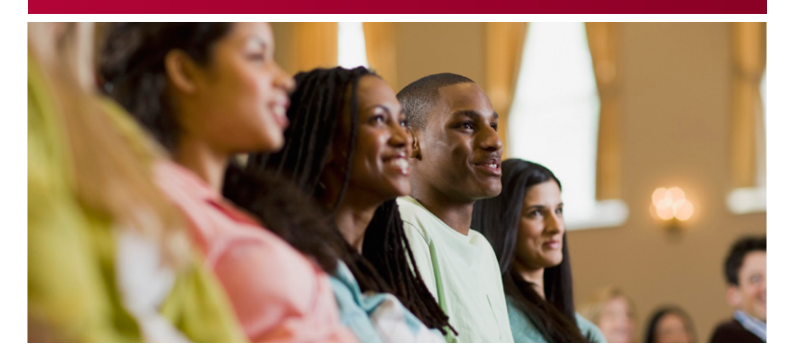
Doctoral Advancement in Nursing Student Toolkit